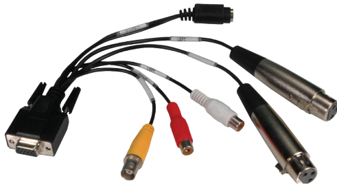
Input Breakout Cable